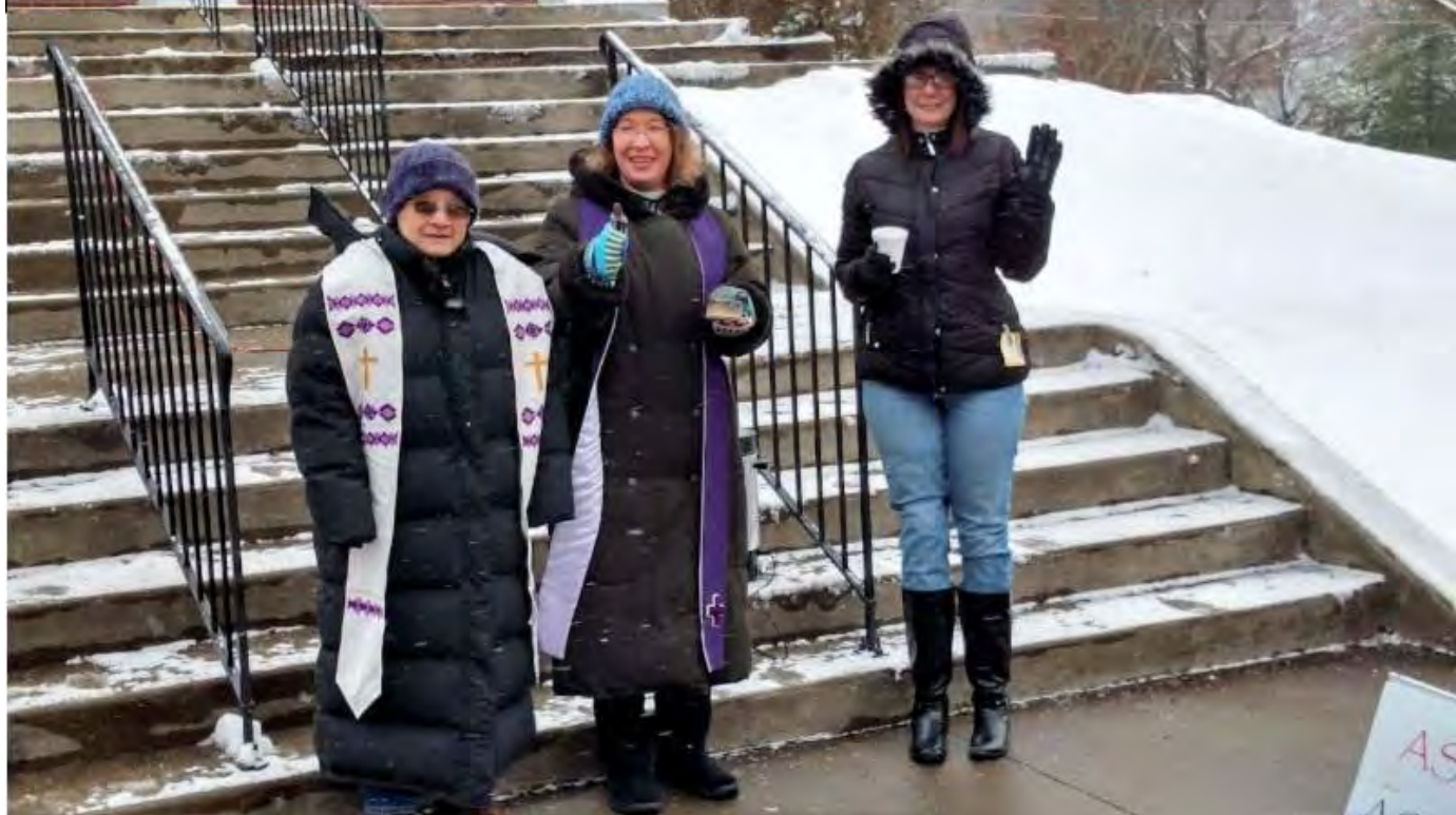
Top Right -- The Sunday School class making Alleluia posters. Top Left -- Putting away the alleluias until we celebrate Christ's Resurrection at the Great Vigil of Easter. Just Above -- "Ashes to Go". Below -- delivering the sermon for the Ash Wednesday evening church service (please see audio link below photo).