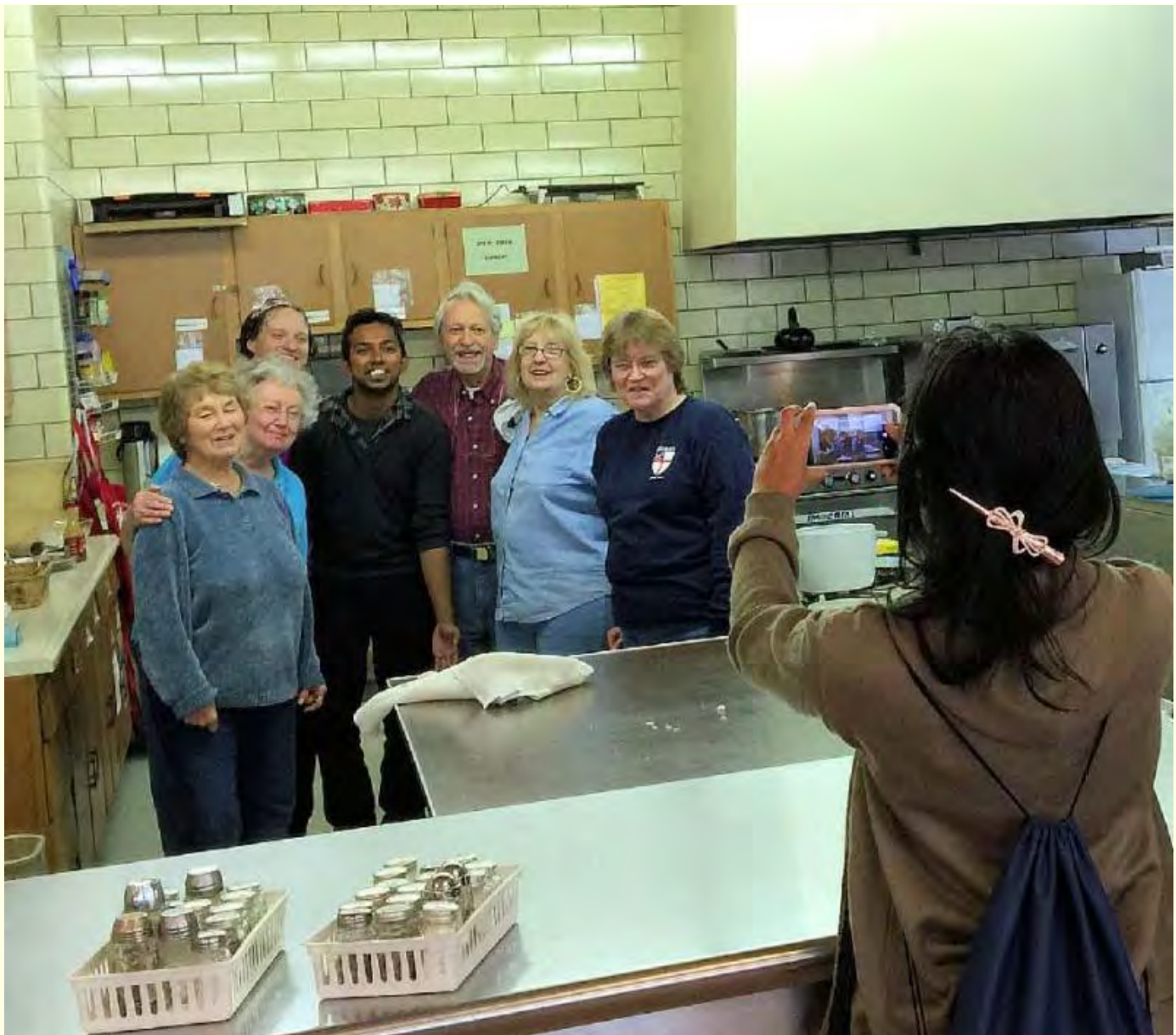
Photo of Lunch group getting photographed -- Yesterday, an international graduate student who is going back home with a degree wanted to take back a photo of the Wednesday lunch crew to show his parents and friends back home.