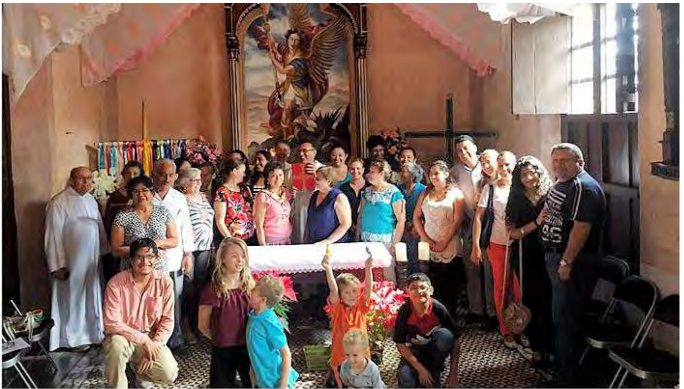
St. Luke's Anglican mission in Mérida, Yucatán

How will Good Shepherd move into this new relationship based on friendship and our common Anglican roots? First, we will begin to pray for our sister congregation, St. Luke's, in Mérida. Then, through applying for grants, we hope to send a first group to Mérida in early January 2018 on a Friendship Building visit. The group would be small (10-15 persons) and intergenerational with the hope of offering scholarships to offset the cost of travel. In addition to parishioners from Good Shepherd, we also want to offer this opportunity to students at OU. Parishioners at St. Luke's would house our group. We would gather for meals, for visiting, for some sightseeing, and for sharing the Eucharist. To reciprocate, we would invite a contingent from Mérida to come to Athens at some future time.