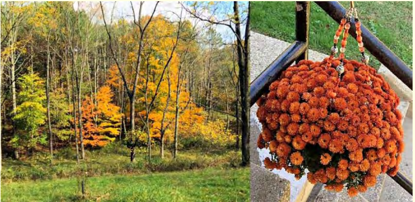
Some fall colors!