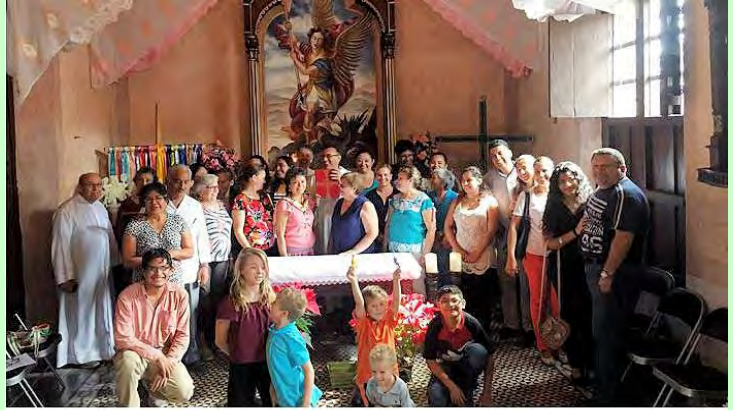
St. Luke's Anglican mission in Mérida, Yucatán

we're looking for a diverse group of no more than 10 who would be interested in participating in this encuentro (meeting) with fellow Episcopalians in Mérida who yearn for a relationship with like-minded Christians. This is a trip where we have been invited to stay with families from St Luke's, to deepen our bonds of friendship, and to share in their remarkable journey in establishing a permanent Episcopal church in Mérida. We'll not build houses or churches but rather friendships. The cost would be only airfare to Mérida and perhaps some extra spending money.