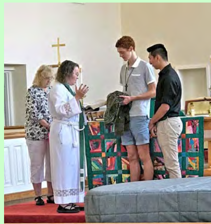
Some Blessings this past Sunday