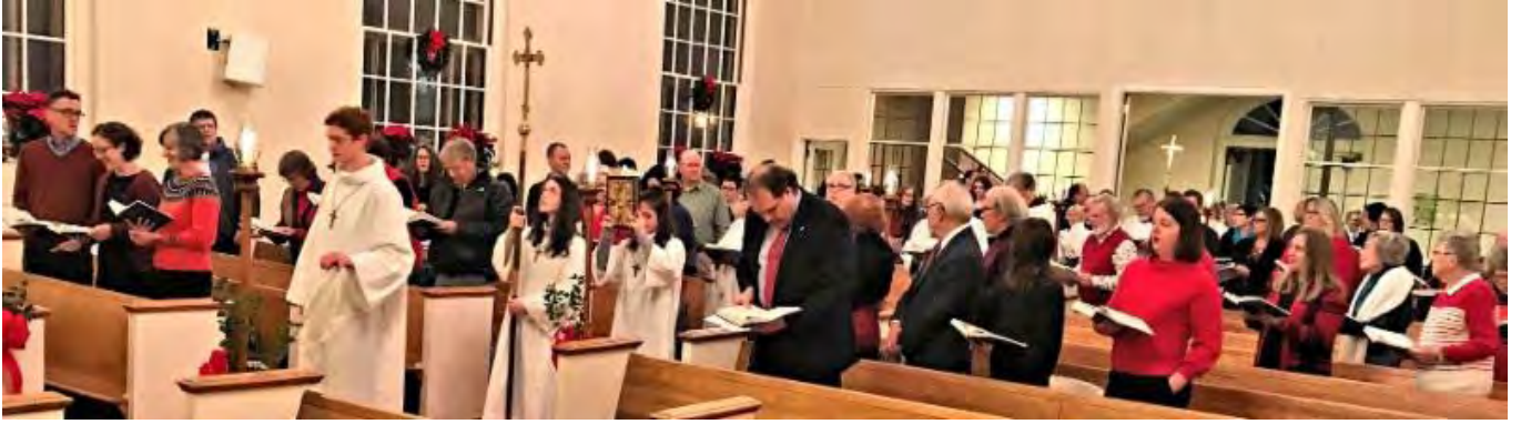
Procession, Christmas Eve Service