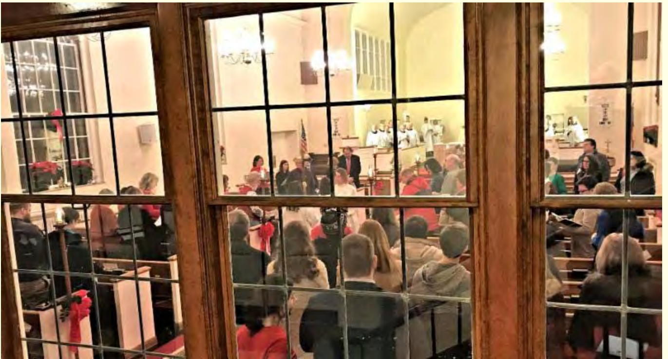
Reading the Gospel Christmas Eve.