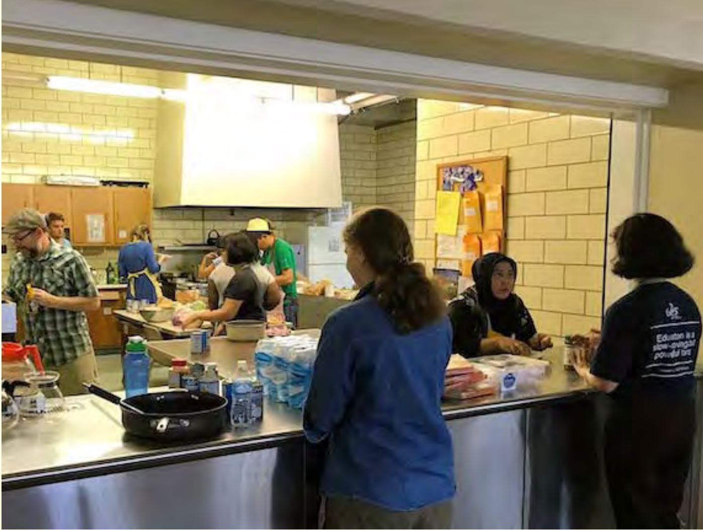
Students used the kitchen to prepare a huge variety of tasty international cuisine for a Fulbright Scholarship event.