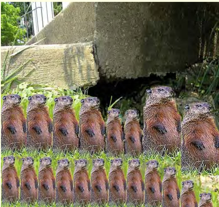
Above , getting motivated to preach.