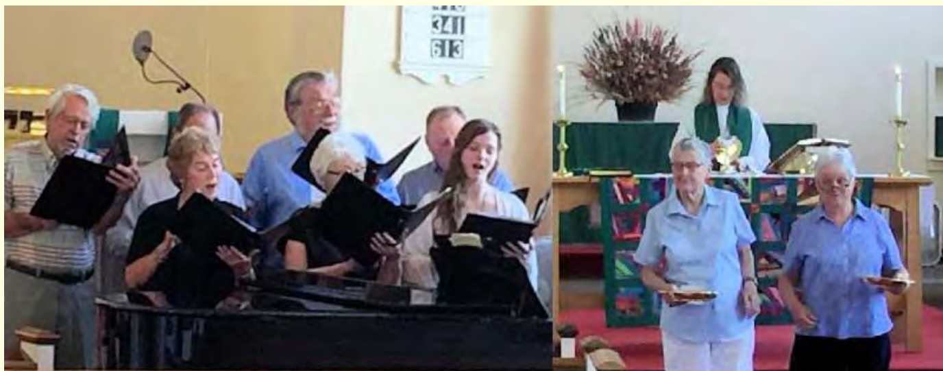
Left: Choral Ensemble