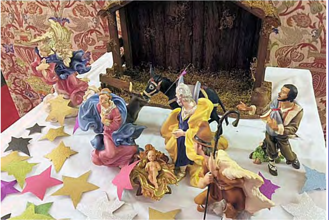
The kids set this up and thought that Jesus was best outside for the afternoon.