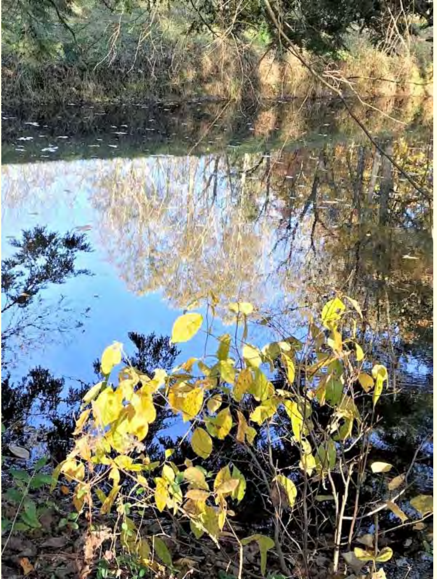
Not much in the way of fall leaf season this year but the smaller stuff brightens up with the help of the pond's reflections in the background.