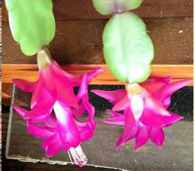
Top: The Choir warming up. Bottom left: First Spring wildflowers. Bottom right: The Christmas cactus is finally getting around to blooming.