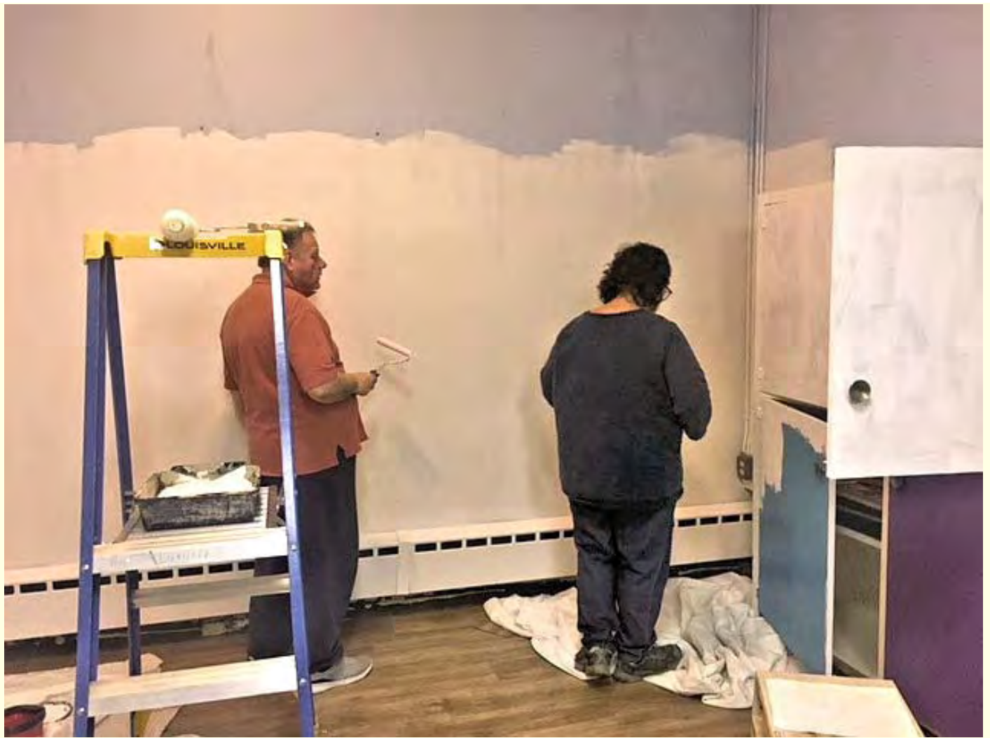
A crew started repainting the classrooms today.