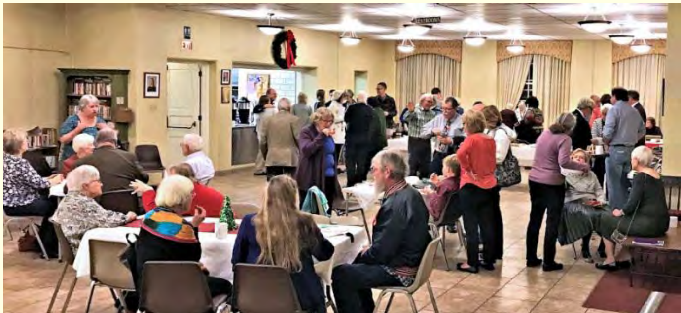
(Top) The just after the procession at the Advent Festival this past Sunday, and (Bottom) there was also a nice crowd at the reception.