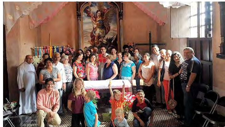
St. Luke's Anglican mission in Mérida, Yucatán

St. Luke's Episcopal Church in Mérida, Mexico, has invited a group from Good Shepherd to visit them January 10-15. With Vestry approval to move forward, we're looking for a diverse group of no more than 10 who would be interested in participating in this encuentro (meeting) with fellow Episcopalians in Mérida who yearn for a relationship with like-minded Christians. This is a trip where we have been invited to stay with families from St