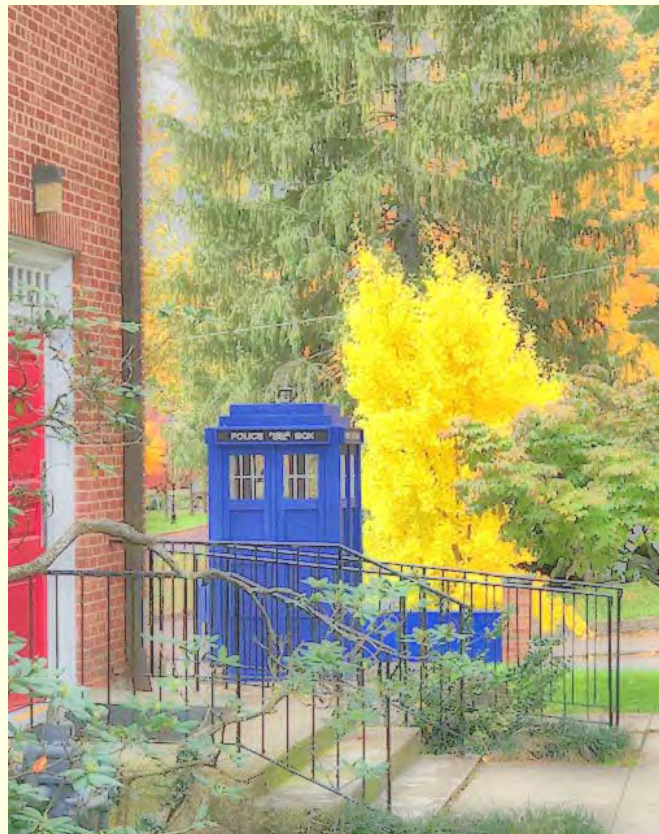
Tardis and Ginkgo Tree