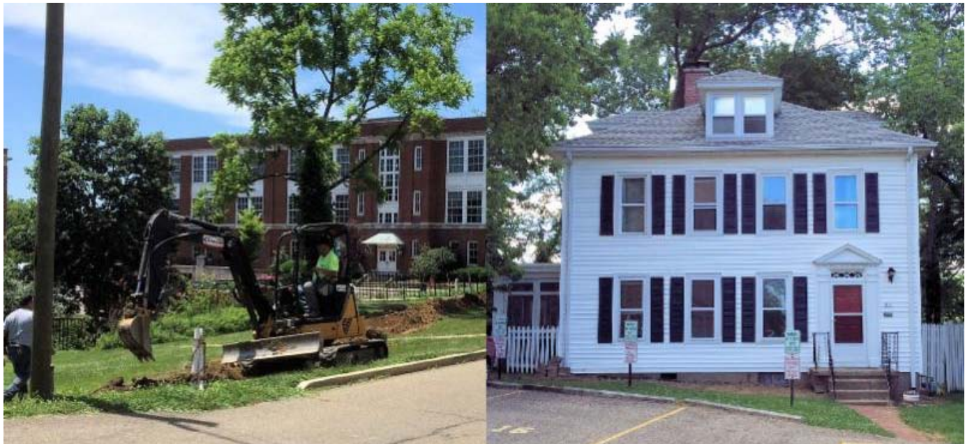
Right: Today the University is putting in the power line for the food truck